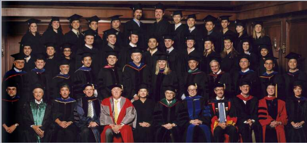
2008 Graduating Class