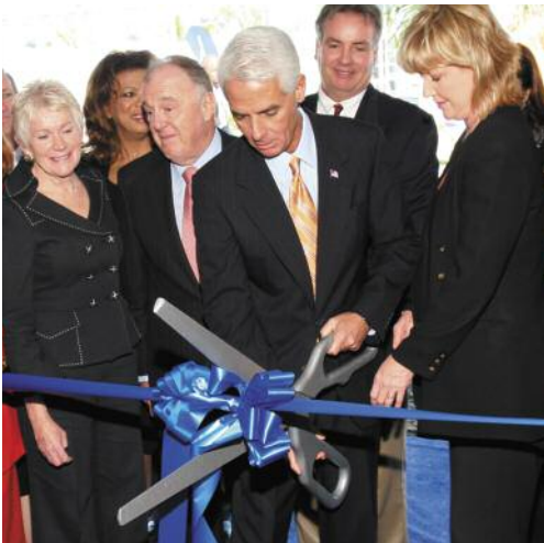
Florida Governor Charlie Crist cuts the ribbon to officially open Scripps Florida.

> The Scripps Research Institute’s leaders were recently joined by Florida Governor Charlie Crist and Palm Beach County commissioners to cut the ribbon to officially open Scripps Florida, the institute’s 350,000 square-foot state-of-the-art biomedical research facility in Jupiter.