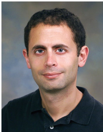
Professor Benjamin Cravatt

diagnostics and drugs, since cancer treatments often aim to induce apoptosis in malignant cells. The study also marks the development of a basic new tool of “proteomics”—the large-scale study of proteins—that should provide useful insights into many cellular processes.